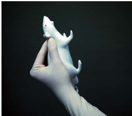
Retention / Holding