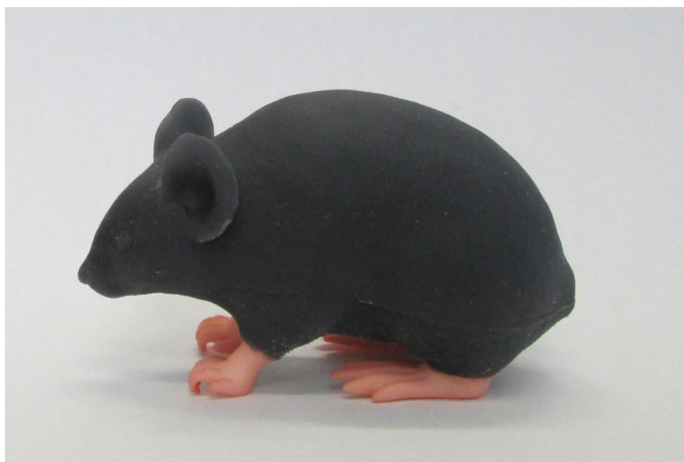
Mimicky Mouse Body