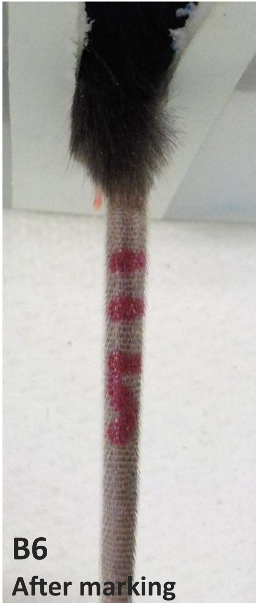
B6 After marking