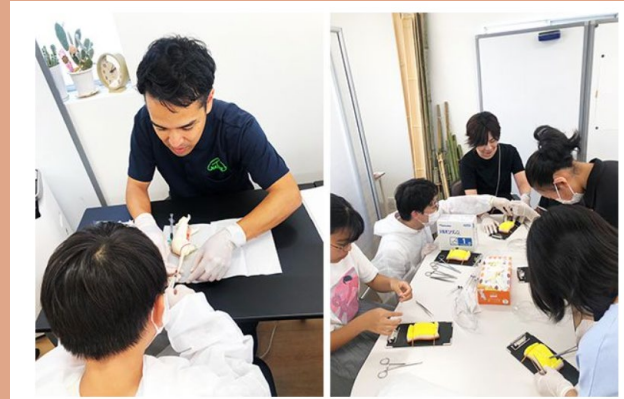
Education on animal testing for children