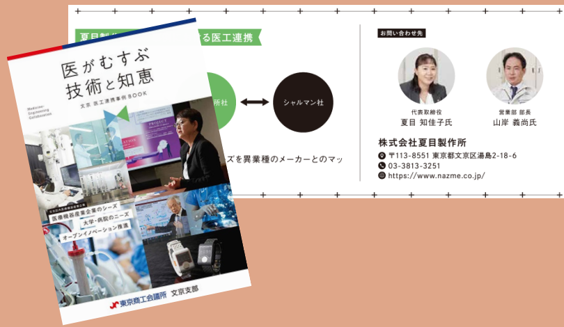
Cooperation in coverage of medical-industrial collaboration cases