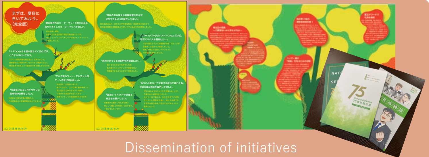
Dissemination of initiatives