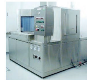
Rotary Cage Washer