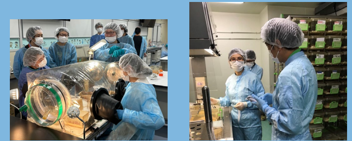
Creating opportunities for qualification and learning