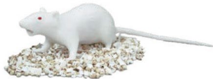
Simulator of animal experimental technique Natsume Rat