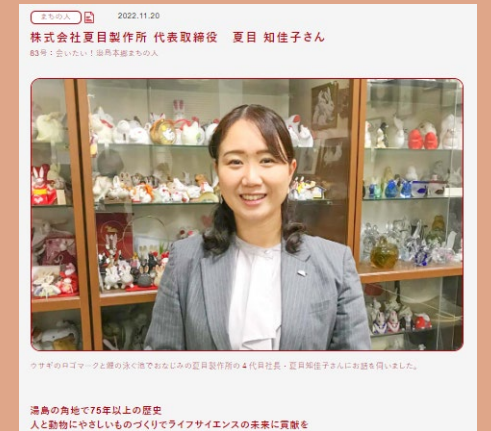
Involvement with the local community