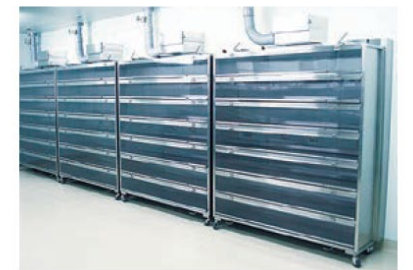
Negative Pressure Breeding Rack