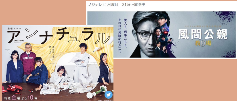
Provision of equipment to the media